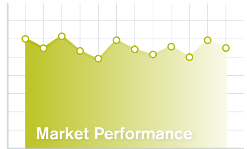
For illustrative purposes only, does not represent actual market fluctuation.

The longer your money is invested, the more likely you may be able to manage market fluctuations.